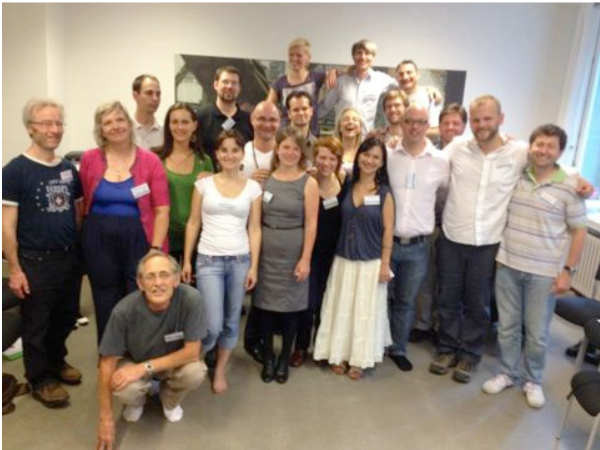
Participants of the Integral Europe Gathering in Berlin, 2012-06-18